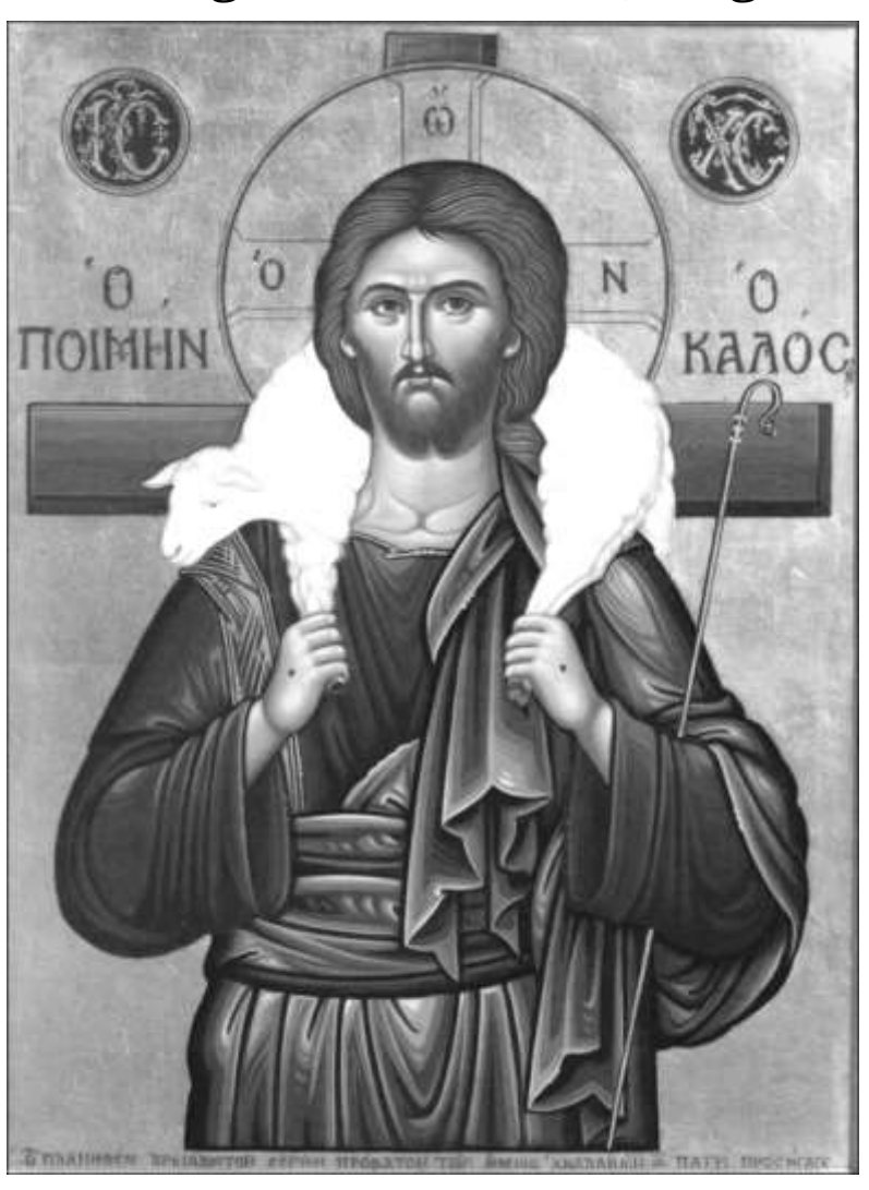
The Fourth Sunday of Easter April 25, 2021