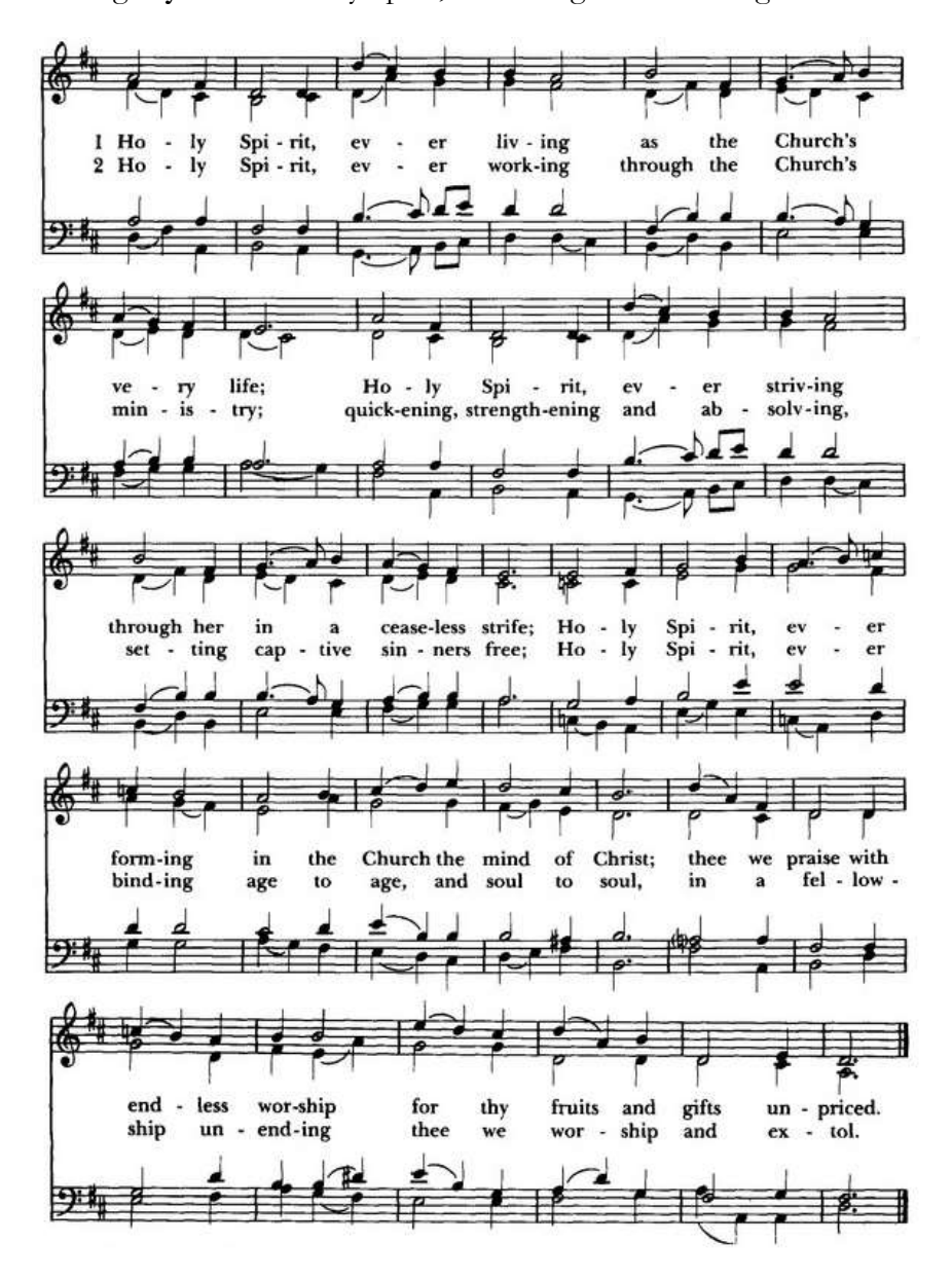
Closing Hymn 511 "Holy Spirit, ever living" Abbot's Leigh