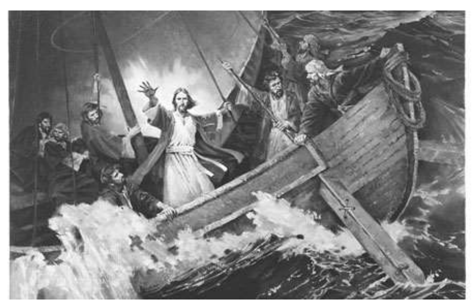
Christ Calms the Storm on the Sea of Galilee

The 4<sup>th</sup> Sunday after Pentecost June 20, 2021