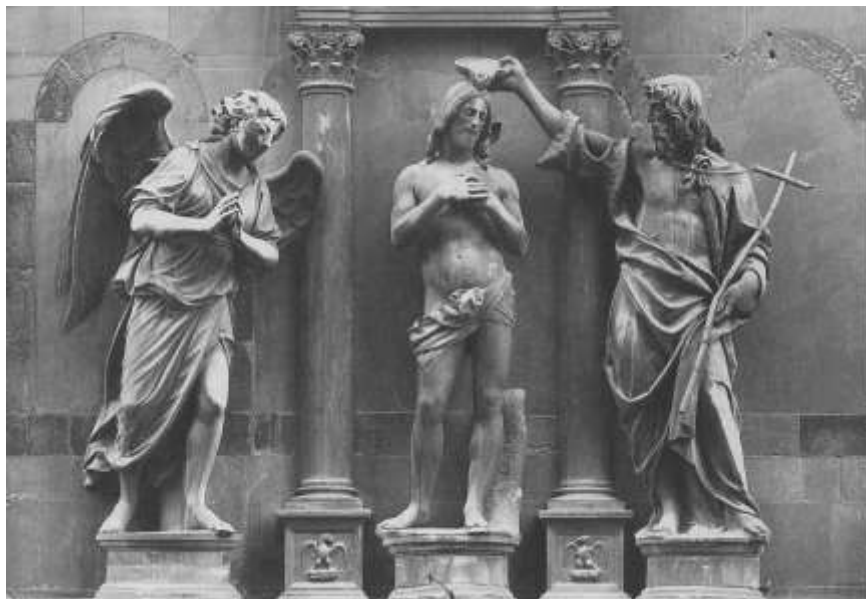
Baptism of Christ , Baptistry, Florence Andrea Sansovino (c.1502-5)