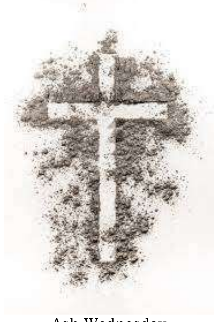
Ash Wednesday March 2, 2022