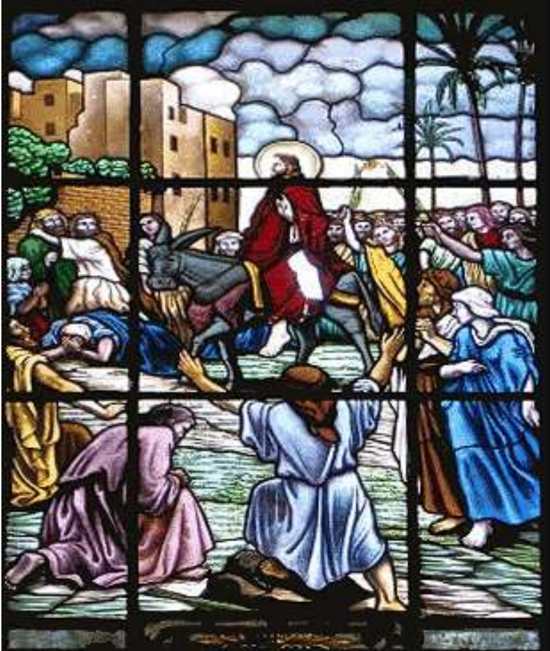
Cathedral of Santa Ana, Tarma, Peru

http://www.stirlinganglican.org.au/wp/wp-content/uploads/2012/02/palmsunday.gif