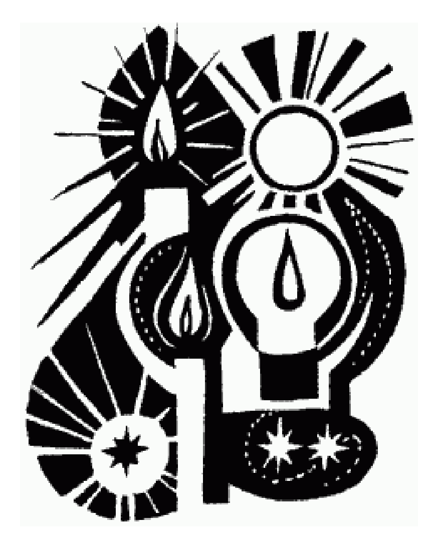
First Sunday of Advent November 27, 2022