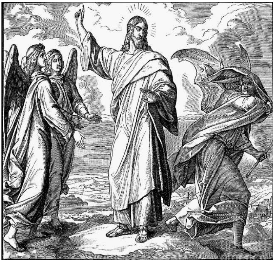
SATAN TEMPTS JESUS.