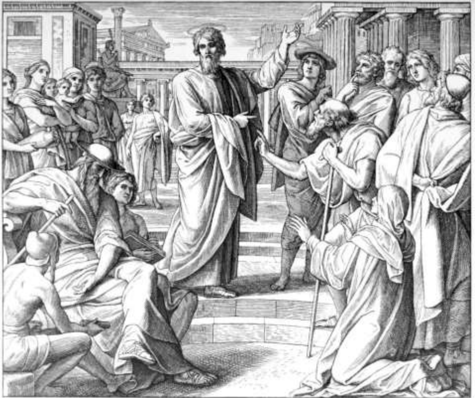
“Paul teaching in Athens”

engraving by Julius Schnorr von Carolsfeld. from “Die Bibel in Bildern (The Bible in Pictures)” 1852-1861.