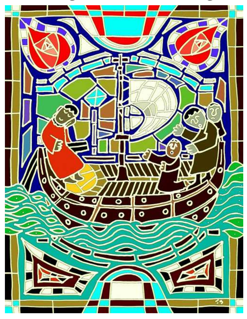
The Fifth Sunday after Pentecost June 23, 2024