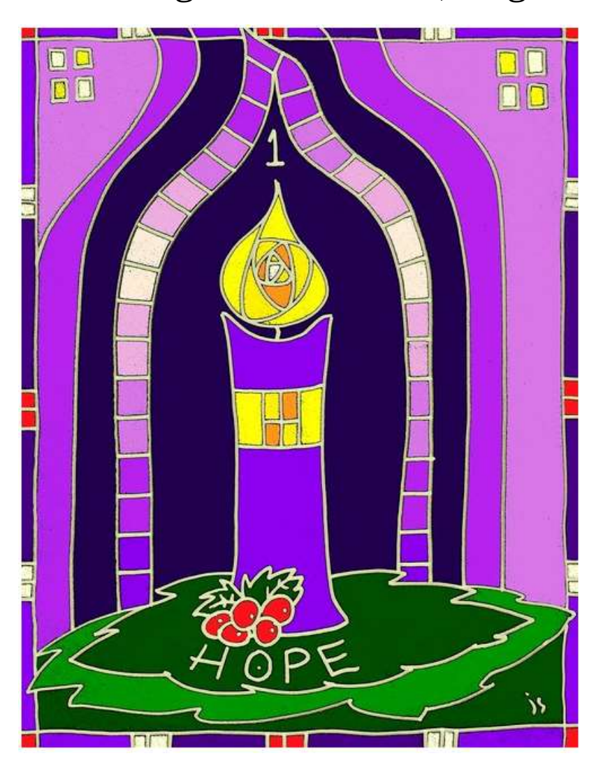
The First Sunday of Advent December 1, 2024